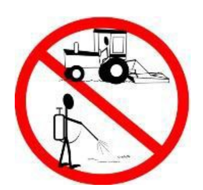
PLANT PROTECTION NO MOWING/NO SPRAYING SP-04315 24" X 24"